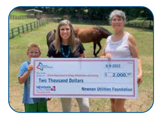
CORRAL • corraltrc.org

Provides therapeutic horseback riding facilities and instruction for the mentally and physically challenged